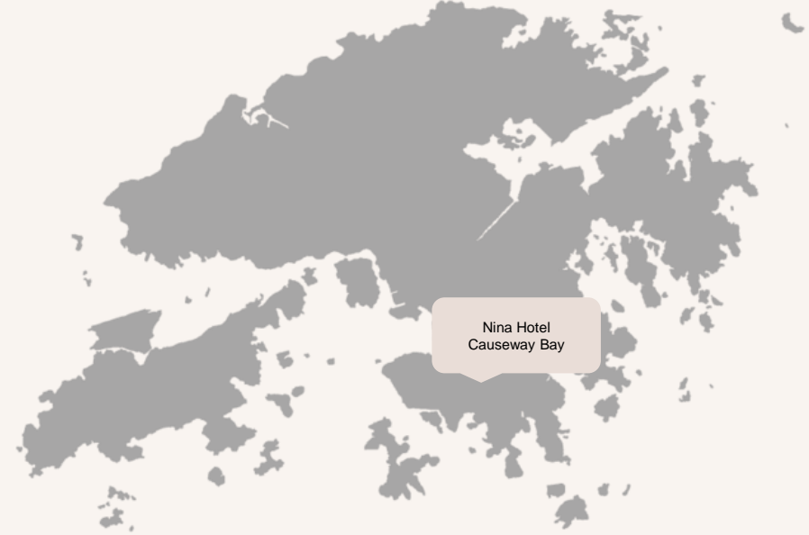
Nina Hotel Causeway Bay